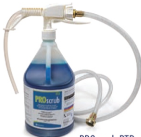
PROscrub RTD Item #LPS303 (dispenser sold separately)

NSF-certified safe for use around food, and with an SDS safety rating better than most deep cleaners and degreasers, PROscrub is ideal for virtually any hard surface including ceramic, tile, metal, industrial flooring, and heavy-duty equipment. It's particularly effective on grout and in other crevices where dirt and grime have accumulated over time.