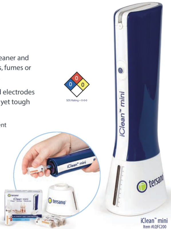
SAO mini Cartridges Item #LOFC204