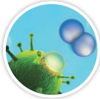
STEP 2 SAO is attracted to germs, soils, and bacteria and quickly eliminates contaminants.